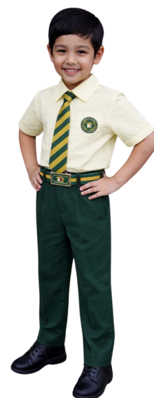
(Boys – Class V to XII))