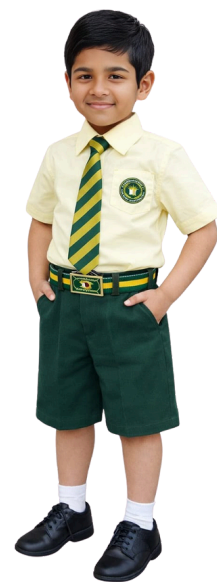
(Boys – Nursery to Class IV))