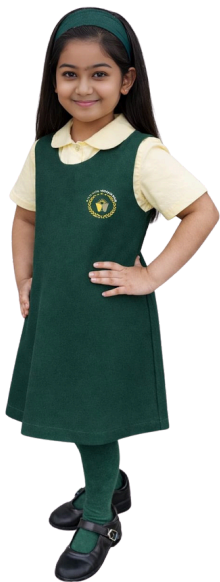
(Girls – Nursery to Class IV))

(Details for Boys & Girls – Nursery to Class XII as per school guidelines)