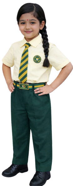
(Girls – Class V to XII))